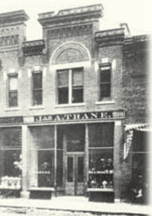
Trane Storefront La Crosse, Wisconsin 1891