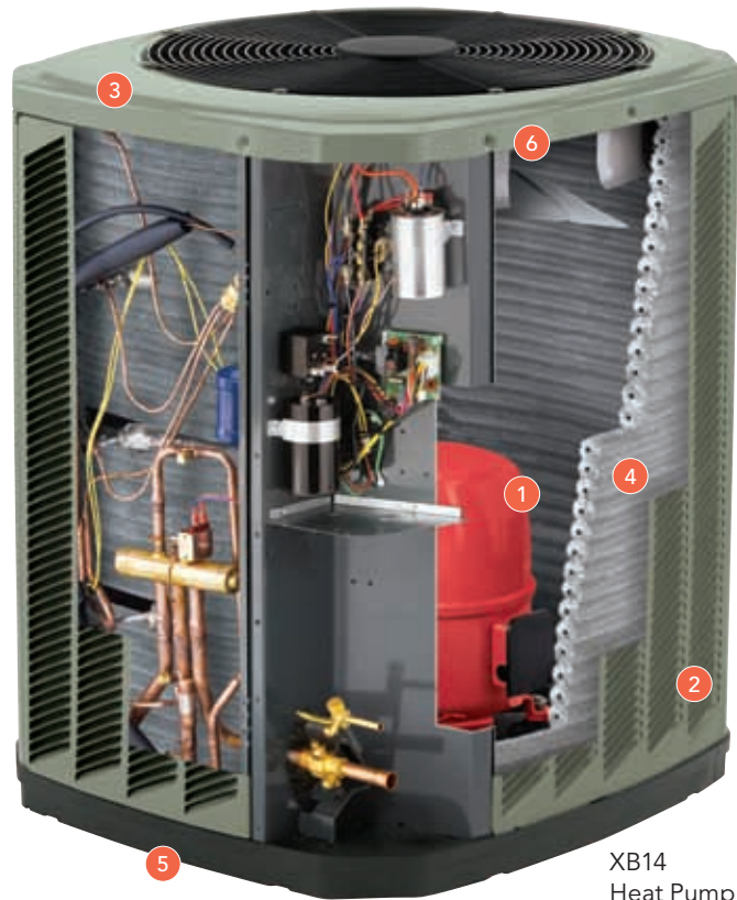
XB14 Heat Pump

Features and components may vary by model and are shown for illustration purposes only.