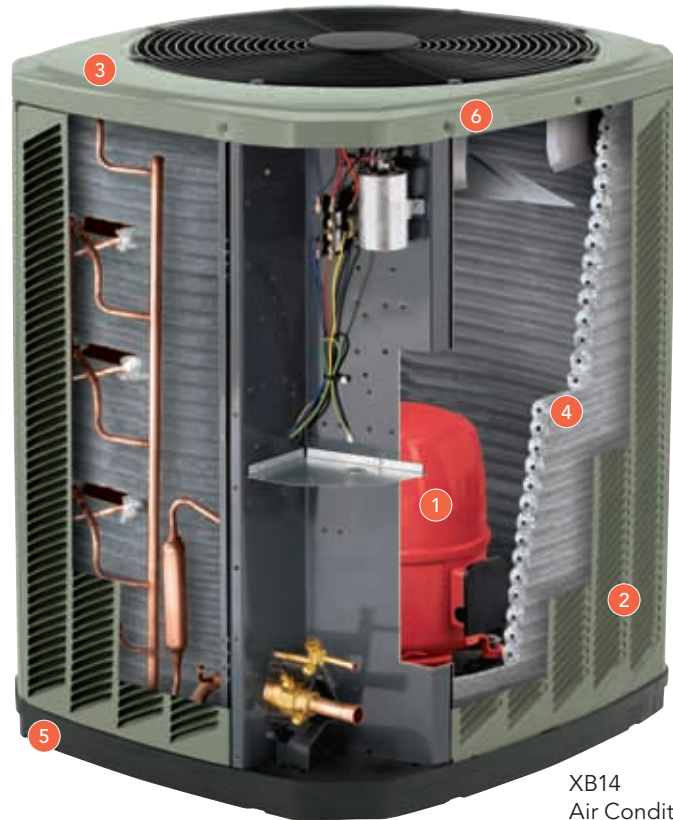
XB14 Air Conditioner

Zinc coated fasteners resist corrosion and keep unsightly rust from discolored your unit.